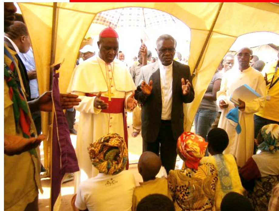
Prayer of comfort for Burundian refugees in Rwanda.