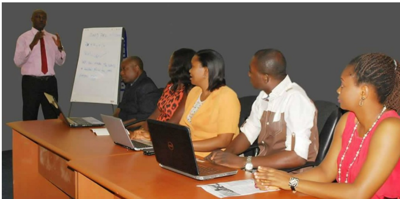
Several National Caritas Members in Africa have developed programmes on Institutional Development and Capacity Strengthening: active participation of Caritas Nigeria social workers.

Internationalis Management Standards (CIMS) where each region has at least one representative. Caritas Nigeria is representing the Africa Region. There is also a CIMS Review Committee where the Region is represented by a delegate from Caritas Lesotho.