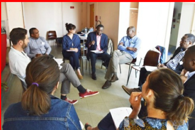
Representatives of Caritas Africa and of the Secours Catholique Caritas France participating in a workshop on the implementation of the A2P-DIRO Programme.

trained in Addis Ababa, Ethiopia and Bucharest, Romania and 40 assessors from 24 countries and the Regional Secretariat trained in Nairobi, Kenya; Manila, Philippines and Vienna, Austria. At least 25 Caritas members are expected to be assessed in 2017.