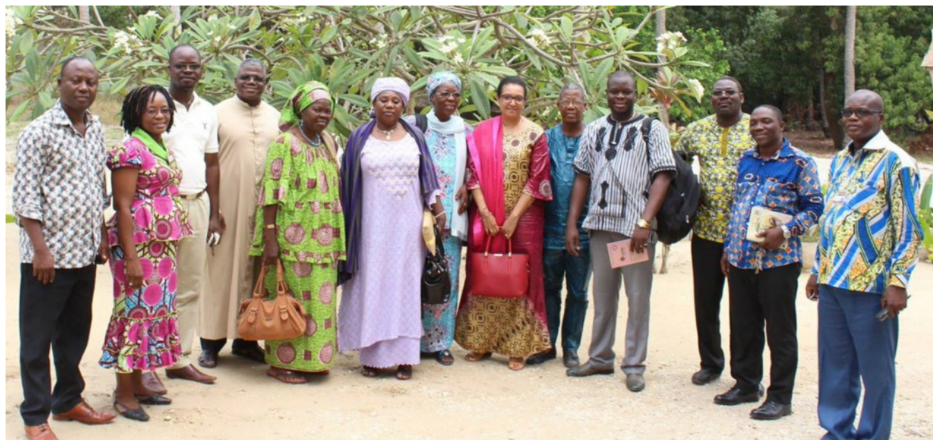
Peer-to-peer training: Caritas Niger representatives visiting Caritas Benin and learning from the experience of their colleagues.

Discussions are taking place with various Northern Caritas partners (CAFOD, Caritas Spain) in order to develop further capacity strengthening initiatives in the Region, with the accompaniment of the Caritas Internationalis Institutional Development and Capacity Strengthening (IDCS) Department.