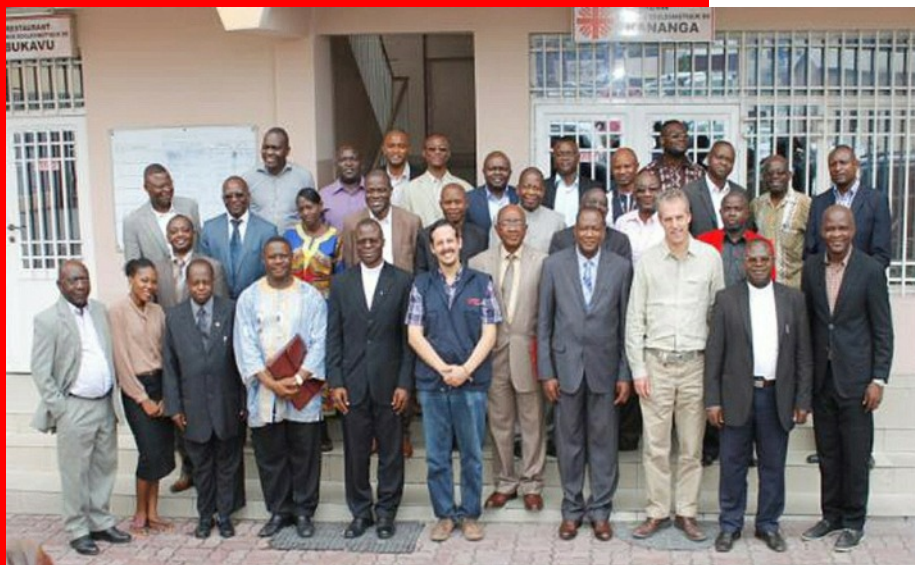
Participants at the REBAC launching ceremony in Kinshasa, Democratic Republic of Congo - October 2015

Caritas Senegal also organized a workshop in October 2016 in Dakar, on Migration and intra-territorial mobility.