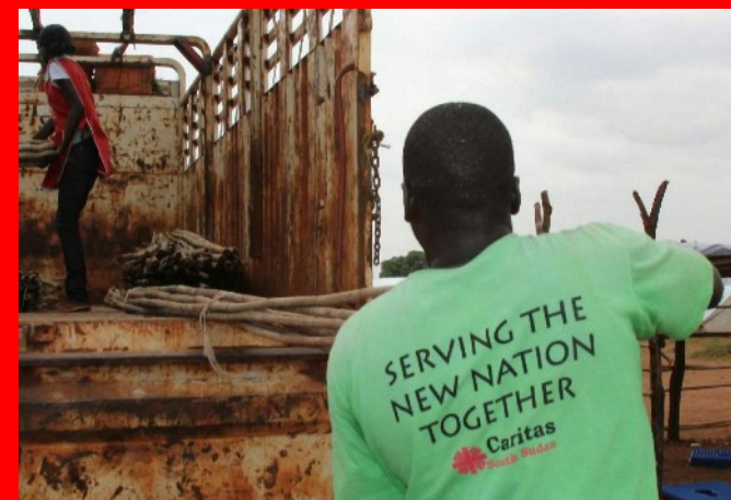
CAFOD working with Caritas South Sudan to provide food, shelter, safe water and better sanitation to prevent the spread of diseases.