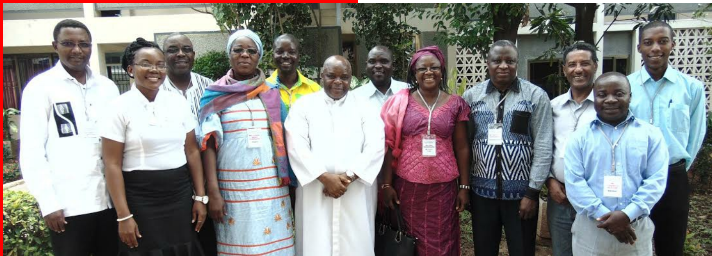
Participants at the SECAM Consultative Meeting on Climate Change and Food Security.

In collaboration with the Zone Coordinators and national Directors, Caritas Africa Regional Secretariat has appointed 15 representatives in different Working Groups set up by Caritas Internationalis in the framework of the implementation of its Strategic Orientation n°3 (Promote sustainable integral human development) and n° 4 (Build Global Solidarity).