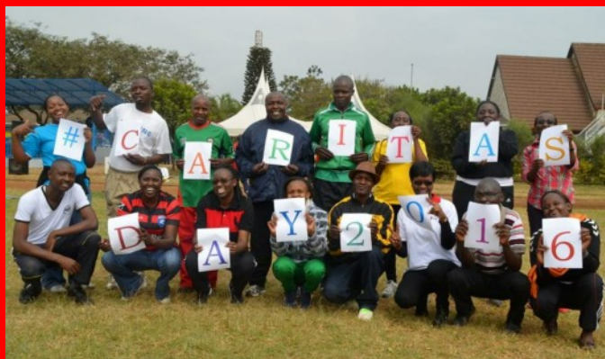
Celebration of Caritas Day in Kenya.