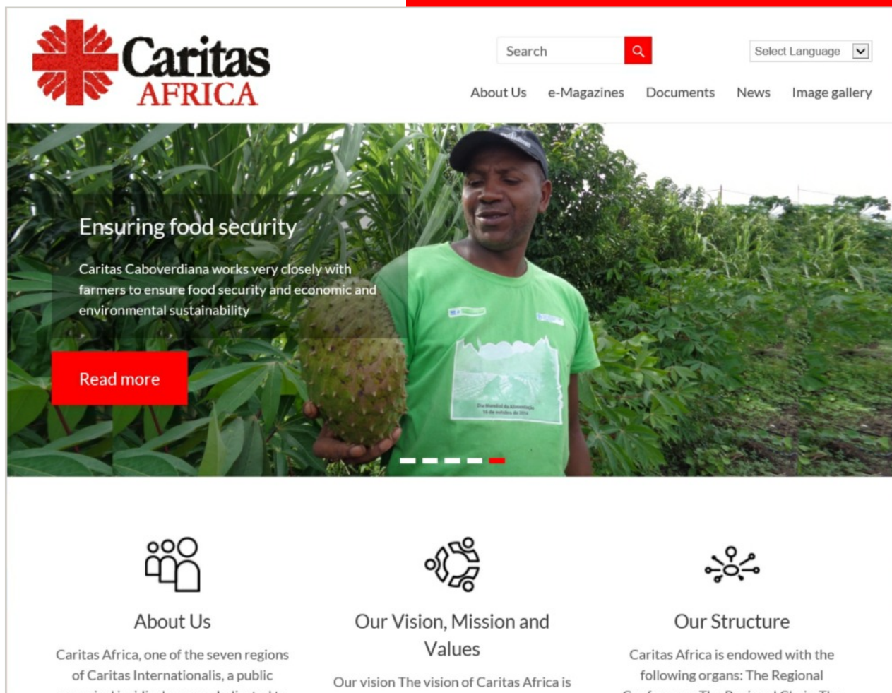
The Caritas Africa website.

By its active presence in regional civil platforms and fora, Caritas Africa has been able to speak in favour of the voiceless, those members of society who are left behind and urgently need support.