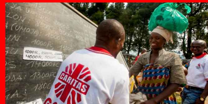
Caritas in Africa Knowledge Exchange and Sharing (CAKES) Platform

An International Conference on Human Trafficking within and from Africa was co-organized in Abuja, Nigeria by CI (+ COATNET) and the Pontifical Council for the Pastoral Care of Migrants and Itinerant People. The conference was hosted by Caritas Nigeria and saw the participation of 19 national Caritas Members from Africa.