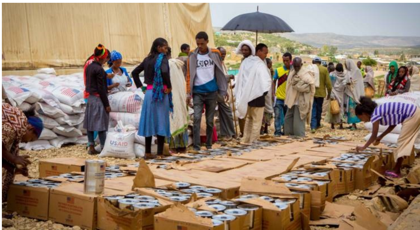
Ethiopia hunger crisis: People gather for an emergency food distribution in drought stricken Mekele.

Caritas Africa also participated in the Ecumenical Conference on South Sudan on 18-19 October 2016 at AACC (All African Conference of Churches) in Nairobi, organized by South Sudan Council of Churches. The key objectives of the Conference were: briefing on the current peace and security situation of South Sudan; sharing the Advocacy Peace Program (APP) of SSCC (South Sudan Council of Churches) and progress so far; exploring ways in which the ecumenical partners can engage with the APP; and getting reports from Africa, Europe, America advocacy hubs journeying with SSCC.