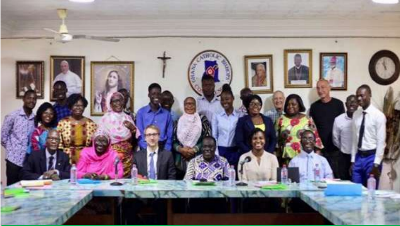
Training of stakeholders on electronic waste management