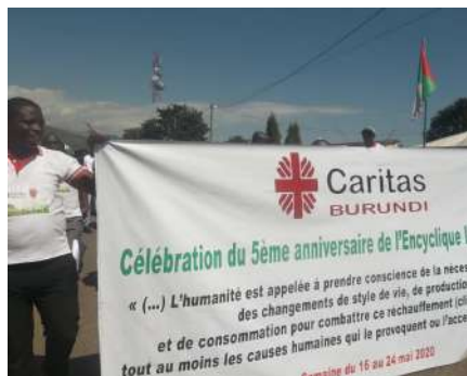
Caritas Burundi marked the day through a press conference and awareness raising initiatives.