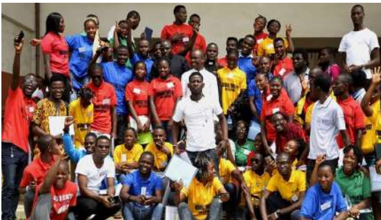
National youth retreat, February 2020