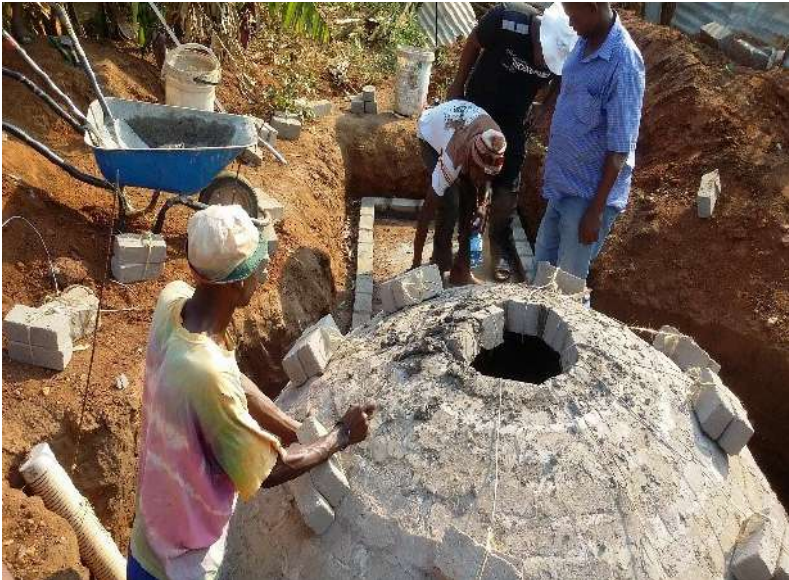
Promoting the use of biogas in villages