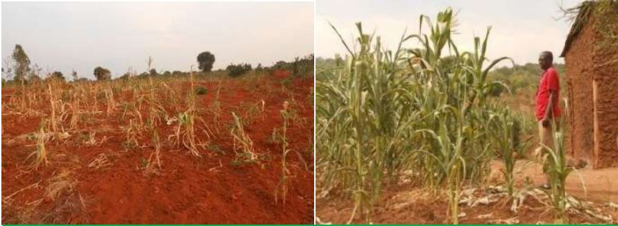
Source Twitter: @Caritas_Burundi on February, 6, 2019. Three communes of Kirundo, Busoni, Bugabira, Kirundo affected by a famine following a drought, a hundred have already gone into exile

⇒ Supporting the establishment of environmental protection committees.