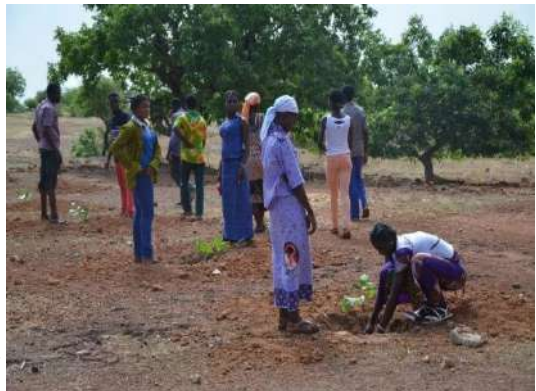
Engaging children, youth and women in environmental conservation activities

⇒ The organization of public conferences on themes related to the environment (pesticides, plastic waste, gold panning, climate change, etc.).