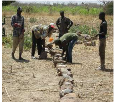
Source: Caritas Mali -Photos N ° 1 and 2: Realization of anti-erosion works / stony cords