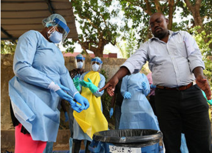
CRS training on handling protective equipment during the outbreak of Ebola.

The survey demonstrates that the CAMOs have vast and varying experience in emergency response. The disasters they have responded to since 2017 include, floods, drought, conflict, epidemics (Ebola, cholera), cyclone, landslides, earthquake, and desert locusts. These hazards are listed in the order of perceived severity. It is acknowledged that currently COVID-19 has the highest impact because of the economic implications and negating gains made in increasing resilience and poverty reduction.