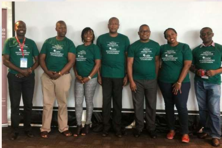
Training of Trainers for Caritas Internationalis Management Standards Coordinators