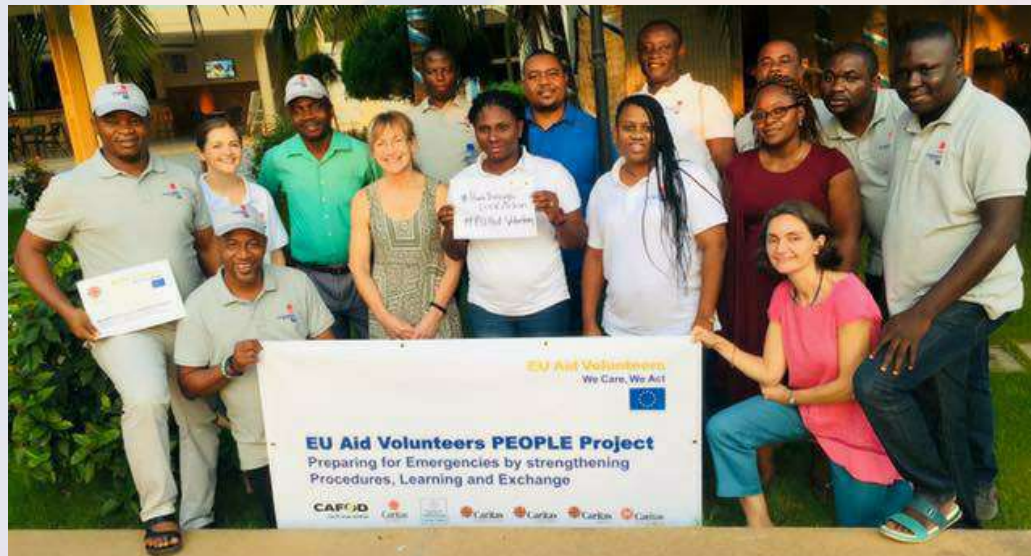
Training in the frame of PEOPLE project in Lomé - November 2018

by strengthening Organisational Procedures, Learning and Exchange » PEOPLE, project is implemented by Caritas Africa, Caritas Liberia, Caritas Nigeria, Caritas Sierra Leone and Caritas Zimbabwe. It is co-financed by the European Commission and the CAFOD (Lead) consortium, Secours Catholique-Caritas France, Caritas Africa and Catholic Relief Services.