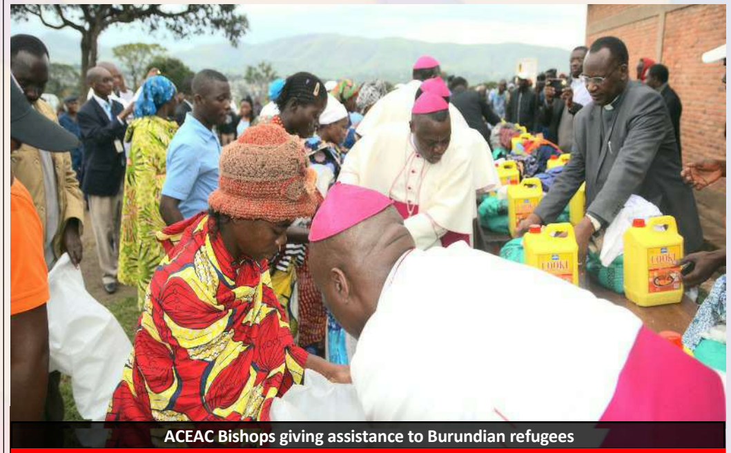
ACEAC Bishops giving assistance to Burundian refugees

In the countries and sub-regions of Africa affected by violent conflicts, seasonal floods or seasonal droughts, Caritas took urgent care of the affected populations without any discrimination. Food aid, health care, psychological support were provided to the affected populations. “I was hungry and you fed me” Mat 25:35.