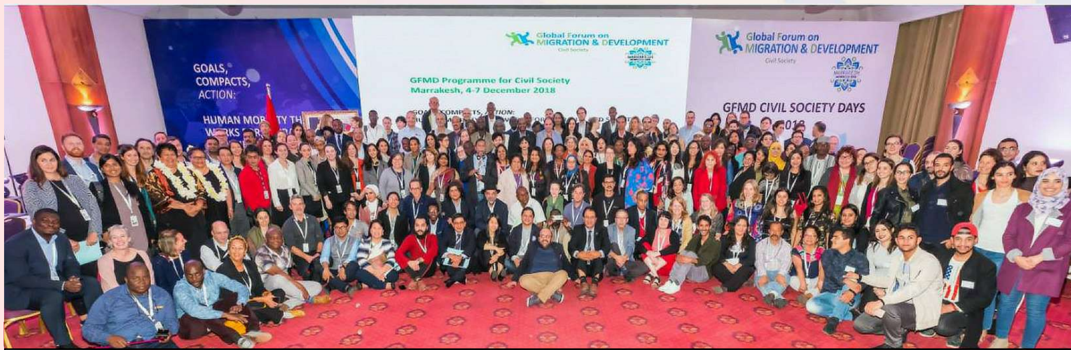
Les participants à la rencontre sur l'adoption du « Global Compact on Safe and Regular Migration » à Marrakech, au Maroc, en décembre 2018.

Contacts established with the African Union, UNECA and the African Development Bank should be continued and consolidated in 2019. Openness to work with other Civil Society Organizations (CSOs) started with the participation of Caritas Africa (Regional Secretariat, Caritas Kenya, Caritas Uganda and Caritas Tanzania) at a CPDE (Civil Society Partnership for Development