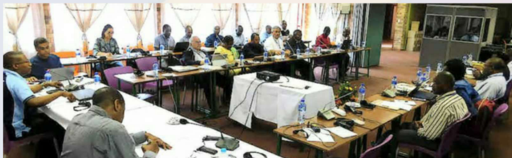
Meeting of the IMBISA Zone Bishops , organised by Caritas Africa in collaboration with Caritas Internationalis.

All the participants in this meeting, especially the Bishops, benefited from an accelerated training on CIMS provided by a team of CRS/ Southern Africa Regional Office and the General Secretariat of Caritas Internationalis.