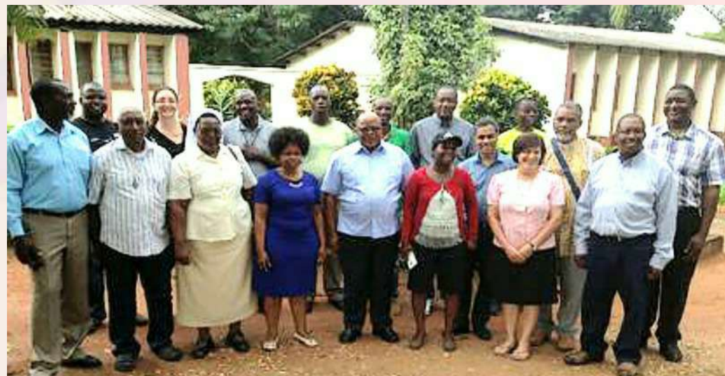
Delegates of Caritas in the IMBISA zone visiting Zambia : Diocese of Monze in March 2018

Representatives from Caritas from South Africa, Lesotho, Namibia and Swaziland, accompanied by representatives of Caritas Africa and the General Secretariat of CI who visited Caritas Zambia in March 2018, agreed to have found enriching and stimulating exchanges on the structuring of Caritas Zambia, its modes of intervention, the challenges of setting up Caritas Zambia at the national, diocesan (Monze) and the parish level. Visitors were interested in the knowledge generated by Caritas Zambia about Cheeba's sustainable socio-economic enhancement project.