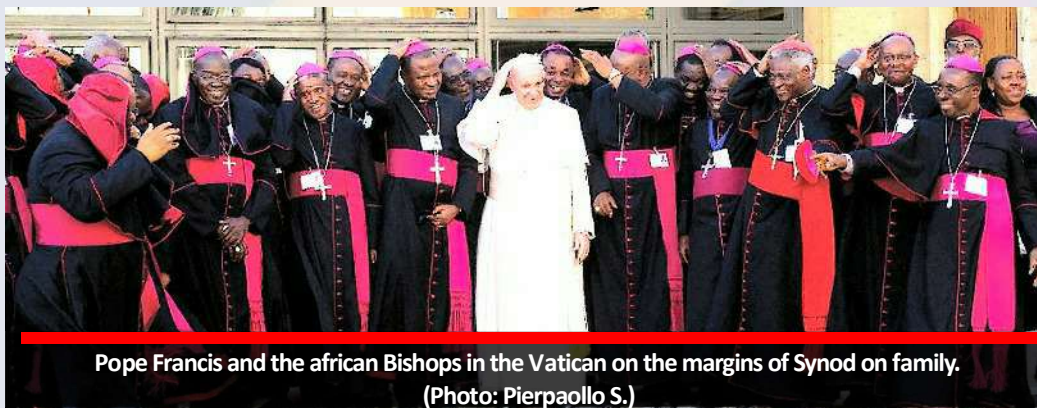
Pope Francis and the african Bishops in the Vatican on the margins of Synod on family.

The interventions of Caritas Africa and its Member Organisations were rooted in the Scriptures and the guidelines of the Magisterium that guide its mission as a technical organ of the Church in the organization of the service of charity.