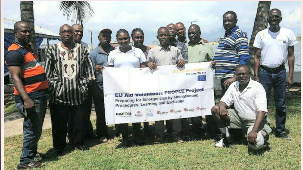
Training in the frame of PEOPLE project in Monrovia, Liberia

The main activities carried out at regional level were: the organization of meetings in Rome and Paris to prepare the start of the project, the launch workshop in Nairobi, the training of trainers workshop on CI tool box devoted to the Emergency and Volunteer Management, the self-assessment of Caritas Africa’s humanitarian capacity and the development of its capacity-building plan in this area.