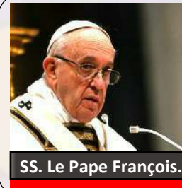
SS. Le Pape François.

On their part, the Member Organisations have also organized various training sessions. For example, a four-day training session on financial resource management, project development and resource mobilization was organized by Caritas Tanzania. This training was attended by diocesan coordinators, accountants and project managers from the six dioceses of Tanzania.