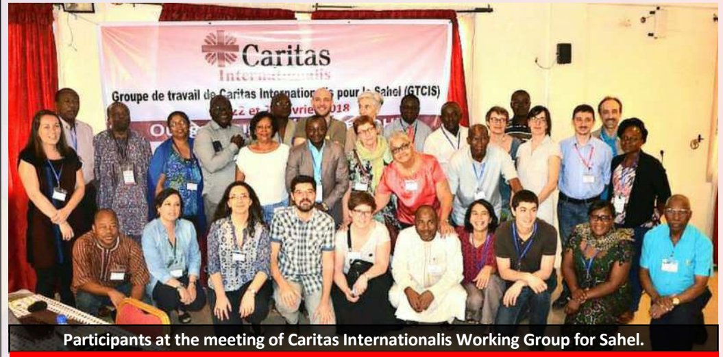
Participants at the meeting of Caritas Internationalis Working Group for Sahel.

19 th to 21 st February 2018. This training was attended by representatives from 20 member organizations of the GTCIS, representatives from other areas of the Africa Region (Kenya, Mauritius and the Great Lakes Africa) and other social and pastoral organizations of the Church and the civil society.