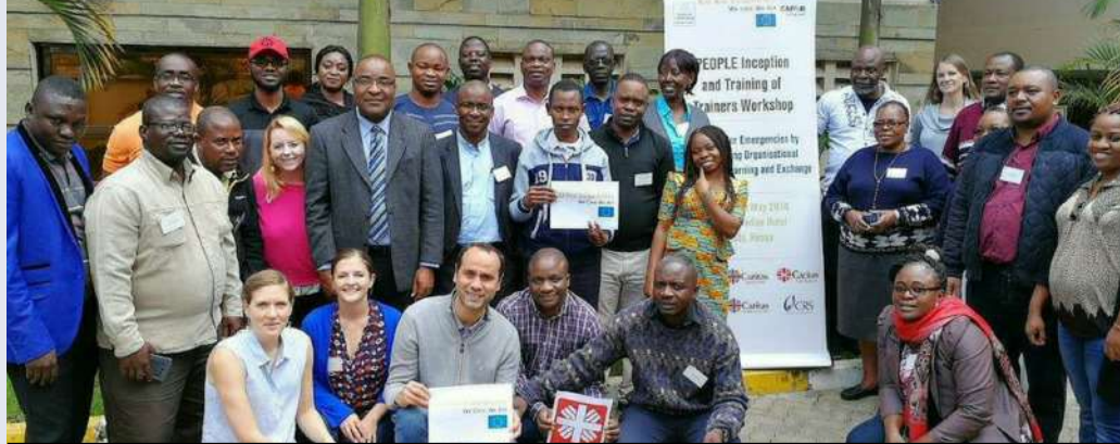
Training in the frame of PEOPLE Project in Nairobi - May 2018

To increase the capacity for effective emergency response, Caritas Africa initiated the PEOPLE project, which was launched in Nairobi in May 2018. The “ Preparing for Emergency