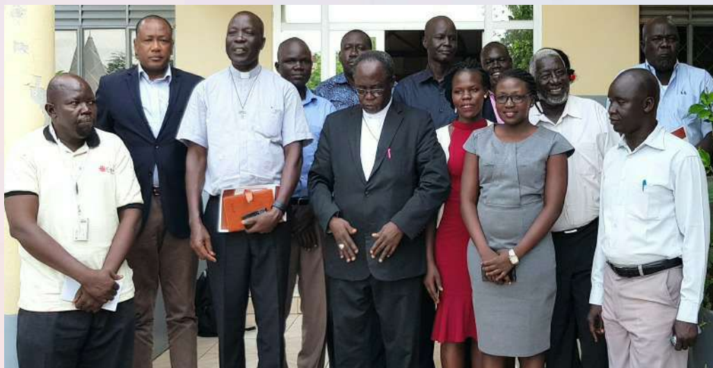
Solidarity visit of the President and the Regional Executive Secretary of Caritas Africa at Caritas South Sudan

Solidarity visits to OCADES-Caritas Burkina, Caritas Congo, Caritas Zambia, Caritas South Sudan, Caritas Côte d'Ivoire (Catholic Church Social Action Forum),