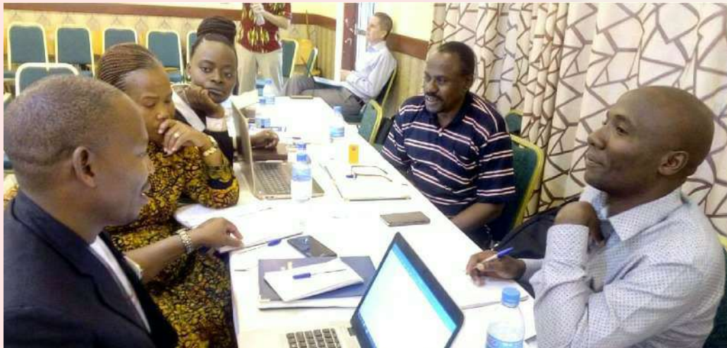
Participants to a training for the capacities strengthening - Caritas Tanzania.

Relevant trainings have been organised to increase the capacity of Caritas staff in Africa to offer quality, marked by respect to the people served.