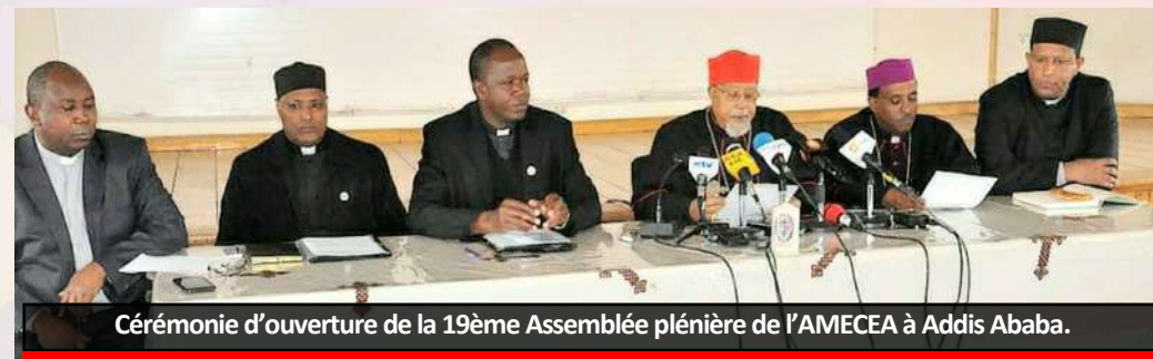
Cérémonie d'ouverture de la 19ème Assemblée plénière de l'AMECEA à Addis Ababa.

The 19 th Plenary Assembly of the Bishops of the AMECEA Zone held in Addis Ababa (Ethiopia) in July 2018, the preparatory workshop for the launching of the SCEAM Jubilee Year in Kampala (Uganda) in July 2018 as well as the meeting of the Bishops of the IMBISA Zone in Pretoria (South Africa) in October 2018 were moments and opportunities to listen actively to the Bishops and to present the work of Caritas Africa and the challenges it faces in its mission.