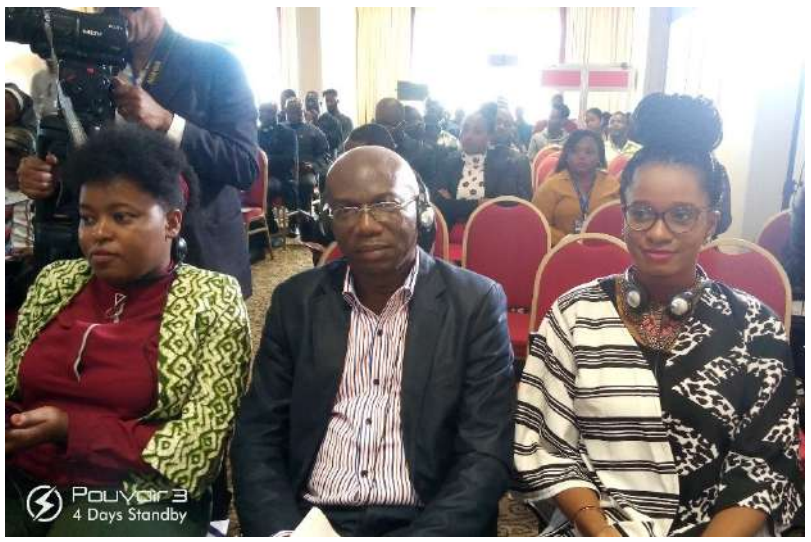
Meeting of SIGNIS Africa in Addis Abeba: Delegates of Caritas Africa.

SIGNIS Africa invited Caritas Africa to a meeting organized in Addis Ababa, Ethiopia in September 2019 on the theme "The African Youth in the Digital World: Promoting creativity for integral Development". Caritas Africa was represented by three Communication Officers respectively from Caritas Kenya, DR Congo and Nigeria who laid the groundwork for future collaboration between these two organisations of the Church in Africa.